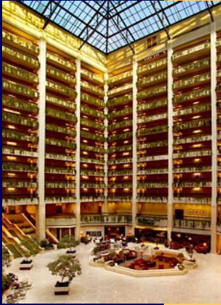
2010 Annual Conference at the Renaissance Waverly Hotel in Atlanta, GA

Japanese Society of Law and Forensic Social Services & the National Organization of Forensic Social Work