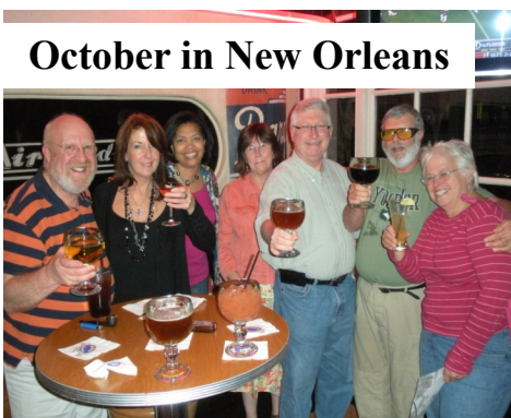
October in New Orleans